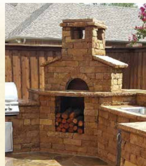
Wood Fired Pizza Oven