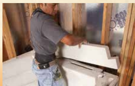
2. Starting the smoke chamber