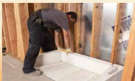
1. Installing base and first course

Easy Installation No mess installation means lower costs and faster completion time.