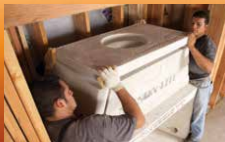
4. Finishing with the dome top