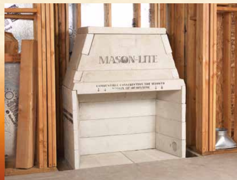
5. Finished Mason-Lite in under 2 hours