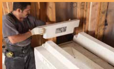
3. Easy to build smoke dome